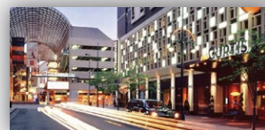
Curtis DoubleTree $205/night