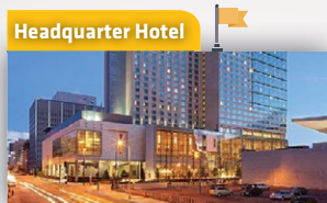
Hyatt Regency Denver $244/night