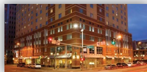
Hilton Garden Inn $221/night