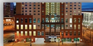
Embassy Suites $215/night