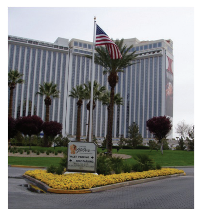
Figure 10: Hilton Hotel after turf conversion to desert landscaping