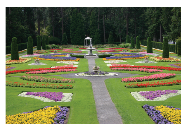
Figure 7: Duncan Garden, Manito Park, Spokane, Washington, displays a variety of annuals. Foreground blue ageratum borders yellow marigolds, white alyssum and lavender petunias.

Perennials and annuals are an important part of a landscape because they provide color and diversity and can be used as accents. When fertilizing both perennials and annuals, fertilizer should be selected based on soil testing.