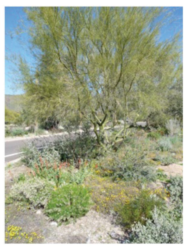
Figure 13: DC Ranch little leaf palo verde (tree), turpentine bush (shrub), bursage (small shrub), firecracker penstemon (red), desert marigold (yellow)

The staff at DC Ranch has four irrigation technicians that manage 306 acres (124 hectares) of landscape. The landscape manager creates irrigation schedules based upon observations by staff and daily inspection reports. Data is collected and analyzed on a computer. Table 7 provides a summary of seven years of irrigation costs at the DC Ranch.