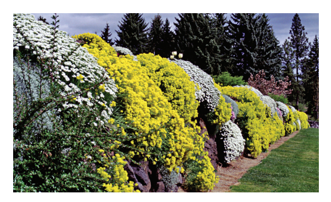
Figure 6: Perennials, such as basket of gold, white rockcress and candytuft, can beautify rock walls

Many perennials produce ornamental fruits and can require less individual care than some annuals. Thus, in some cases perennials are more sustainable.