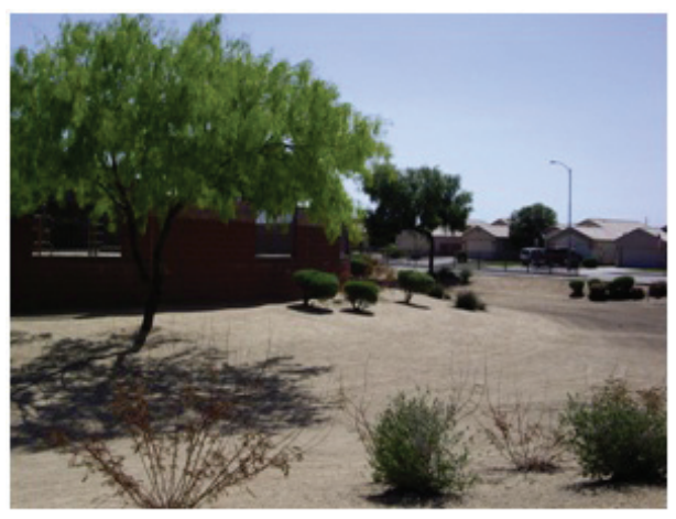
Figure 8: Deer Valley School District: desert landscape with native plants