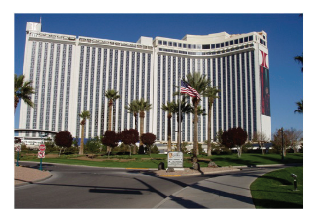
Figure 9: Hilton Hotel before turf conversion to desert landscaping