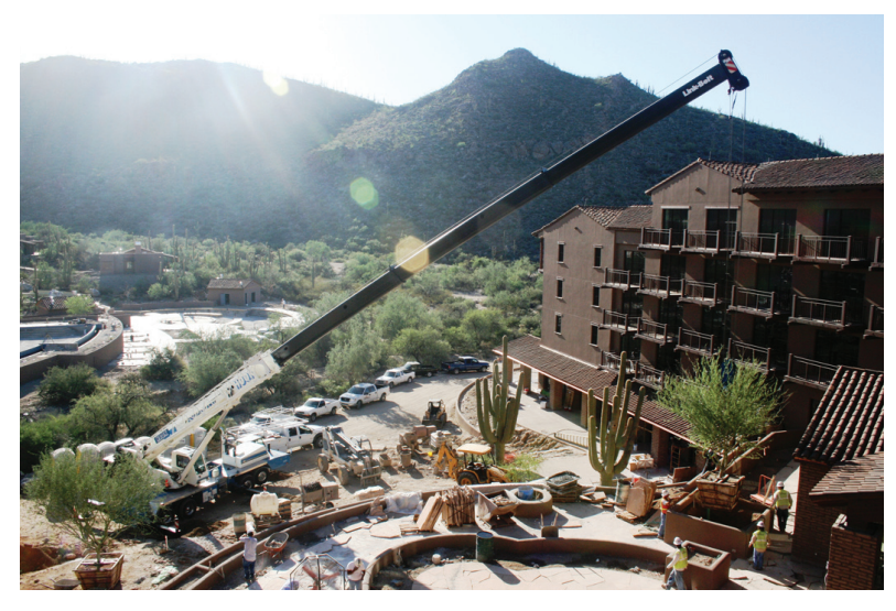
Figure 1: Crane installing 48" (1,220 mm) box palo verde tree

Cranes and other equipment can be used to prevent soil compaction in landscaped areas and/ or prevent disturbing natural areas (see Figure 1). Some landscape contractors are also starting to use biodiesel fueled vehicles (Hall 2009). In addition, low decibel equipment can be used to reduce noise pollution.