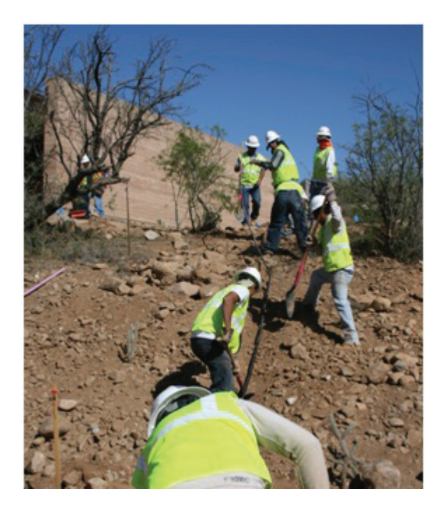
Figure 2: Crew installing drip irrigation tubing in Tucson, Arizona

Sustainable irrigation practices minimize the use of potable water. To obtain credits under the sustainable sites category for LEED certification requires potable water used for irrigation be decreased by 50 percent (SSI 2009a). Additional LEED points can be earned when the use of non-potable water for irrigation is increased to 80 percent or more. The use of non-potable water, also called graywater, should be utilized both on a large scale and on the individual residential level. Within the United States, southwestern desert cities like Tucson and Phoenix, Arizona, and Las Vegas, Nevada, frequently use graywater to irrigate golf courses and parks.