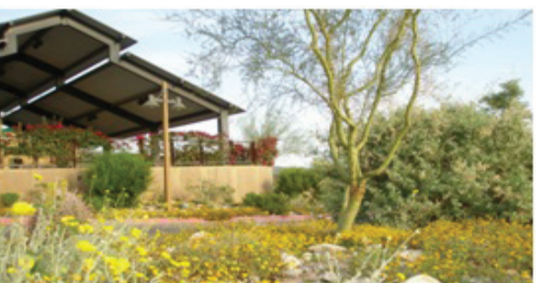
Figure 11: DC Ranch