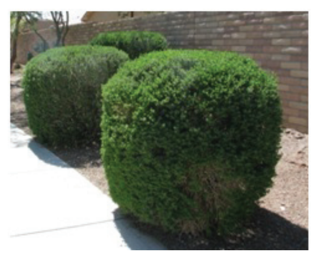
Figure 5: Example of a sheared bush