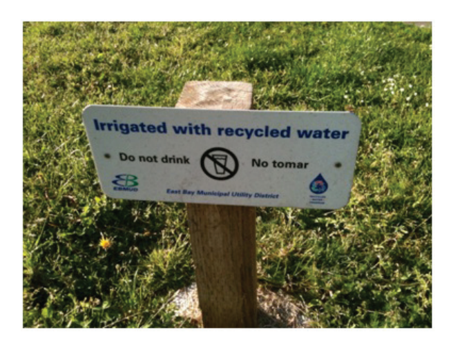
Figure 3: Graywater irrigation signage at Madison Square Park, Oakland, California

Graywater is water that is not treated to potable (drinking) quality, but can be used for non-potable applications, such as irrigation and toilet flushing. When considering using graywater for irrigation or uses within a building, it is very important to contact the local code and/or zoning officials having jurisdiction over the building and site. Requirements for water treatment, storage, coloration, signage and use vary widely by jurisdiction and how the graywater will be used. Figure 3 is an example of required signage at a public park within the San Francisco Bay Area stating that reclaimed (recycled) water is being used for irrigation.