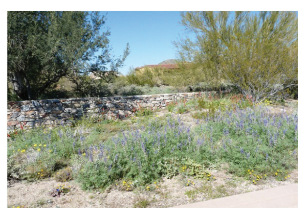
Figure 14: DC Ranch firecracker penstemon (red), Mojave lupine (purple), desert marigold (yellow)

Sustainable landscaping encompasses the skills and best practices of landscape architecture, horticulture and environmental science to create and maintain landscapes that minimize environmental impacts while producing lasting, aesthetic, functional sites that contribute both to human well-being and natural ecosystems. The process starts with team selection and design. The development of a sustainable landscape is best achieved when the team, including the owner and facility manager, continually focus on the sustainability goals through the entire project: design, construction and maintenance.