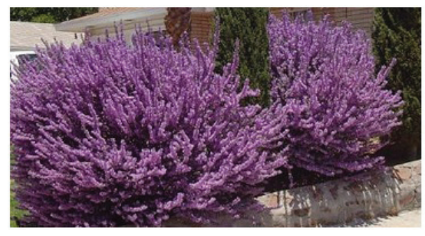
Figure 4: Example of a pruned bush

Formal hedges should be sheared. Shearing is trimming all branches to a uniform length to give the plant a specific shape (Figure 5). Shearing can be done using manual or power shears and does not take into account where a cut is made on new growth. Repetitive shearing creates hardened wood within a plant, shortening its lifespan and usefulness in the landscape. Shearing demands more frequent trimming, requiring more manpower and often generates more plant debris. Therefore, it is recommended that the use of formal hedges be minimized.